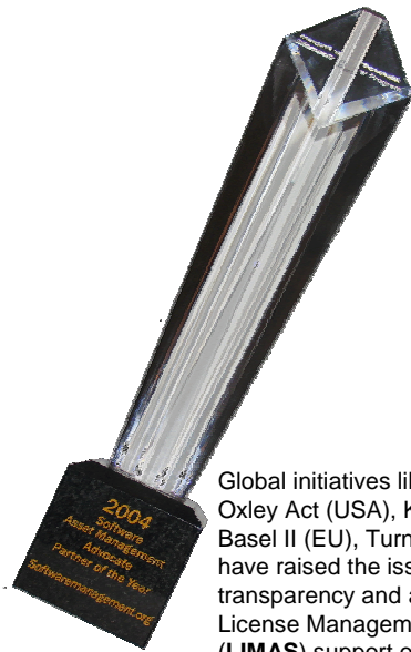
Softwaremanagement.org is the winner of the "Microsoft Software Asset Management Advocate of the Year 2004" award.

Softwaremanagement.org's License Management Audit Services (LIMAS) serve security and business efficiency purposes, providing knowledge about the installed and acquired software basis, gaps and pools, processes and policies. LIMAS enable effective and intelligent planning and optimized purchase decisions regarding software licenses.